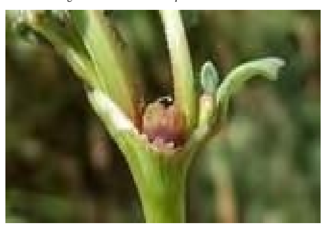
Fig. 3: Showing seeds containing pocket