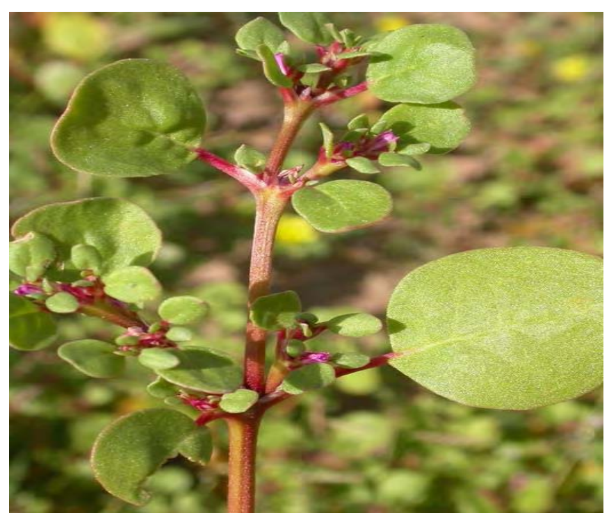
Fig. 2: Plant of Trianthema portulacastrum Linn.

It is a prostrate somewhat succulent herb; stem more or less angular, glabrous or pubescent, much branched. Leaves sub fleshy, obliquely opposite, unequal, broadly obovate, rounded and often epiculate at the apex, cuneate at the base, glabrous; petioles 6-13 mm long, much dilated and membranous at the base. Flowers are solitary, sessile, almost concealed by the pouch of the petiole. Calyx-lobes are ovate, and acute. Stamens 10-20. Ovary is truncate; style 1. Capsule small, almost concealed in the petiolar pouch, lid truncate, slightly concave, with 2 spreading teeth carrying away at least one seed, the lower part 3-5 seeded. Seeds are reniform, muriculate, and dull black in colour. <sup>3</sup>