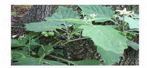
Solanum nigrum L.

The toxicity of S. nigrum varies widely depending on the variety, and poisonous plant experts advise to avoid eating the berries unless they are a known edible strain (Turner and Aderka, 1997). Toxin levels may also be affected by the plant's growing conditions (Edmonds and Chewya, 2002)