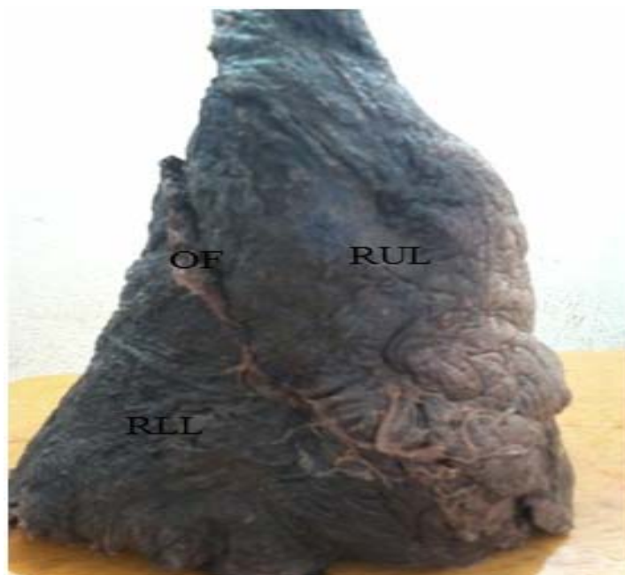
Fig.2. Absence of horizontal fissure in right lung