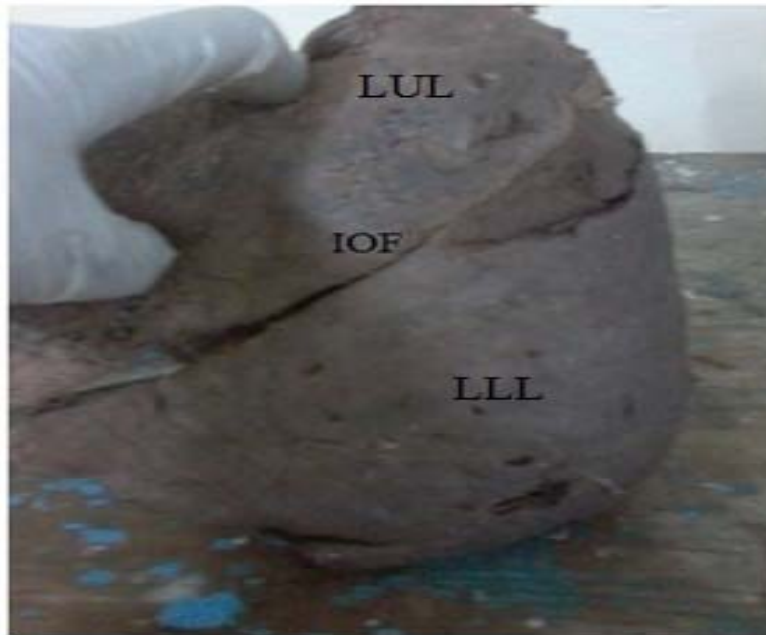
Fig-6- Incomplete oblique fissure (IOF) of left lung