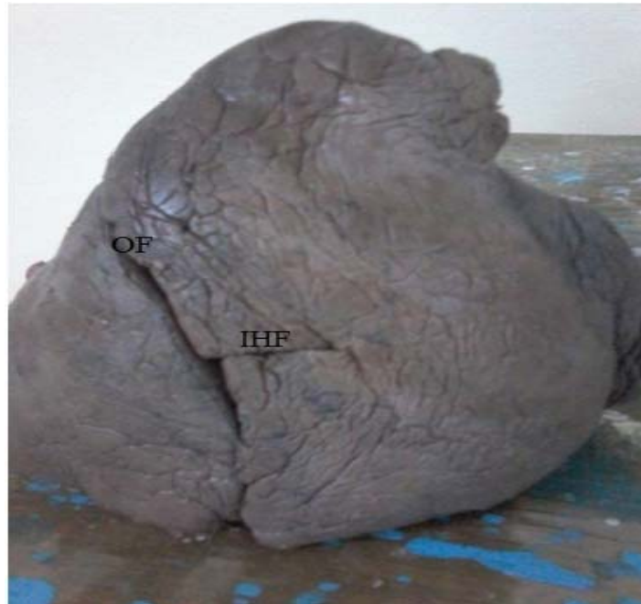
Fig-3- Right lung showing incomplete horizontal fissure