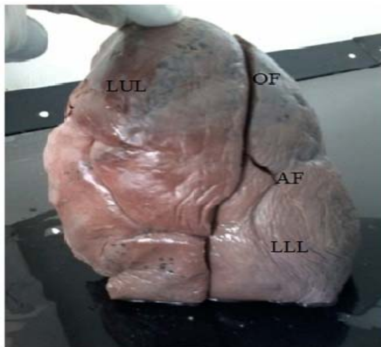
Fig-7- Left lung having accessory fissure in the lower lobe