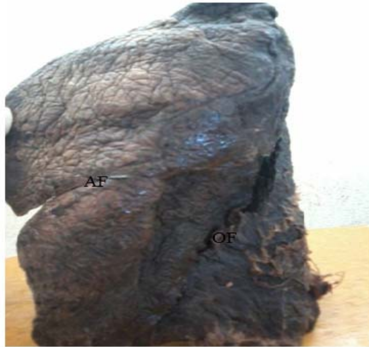
Fig-8- Left lung with accessory fissure in the upper lobe