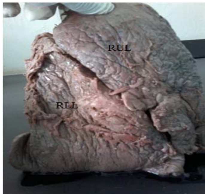
Fig.1. Absence of horizontal fissure in right lung