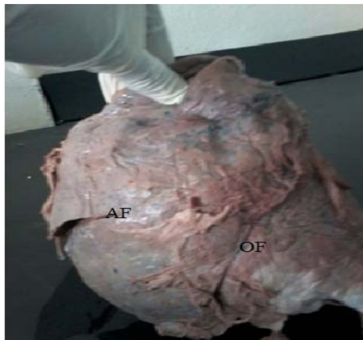
Fig-9- Left lung showing accessory fissure in the upper lobe and three lobes